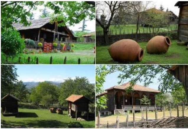
Tbilisi Open Air Museum of Ethnography