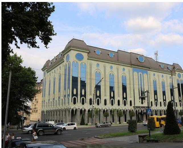
Museum of Fine Arts Georgia

Address 2/4 Aleksandr Pushkin st. Tbilisi