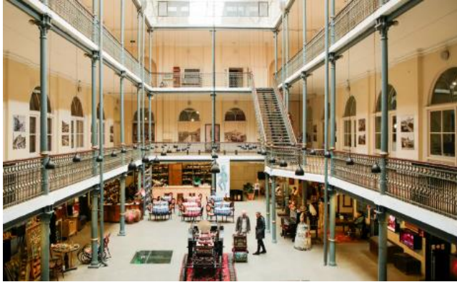
Tbilisi History Museum Address: 8 Sioni st. Tbilisi