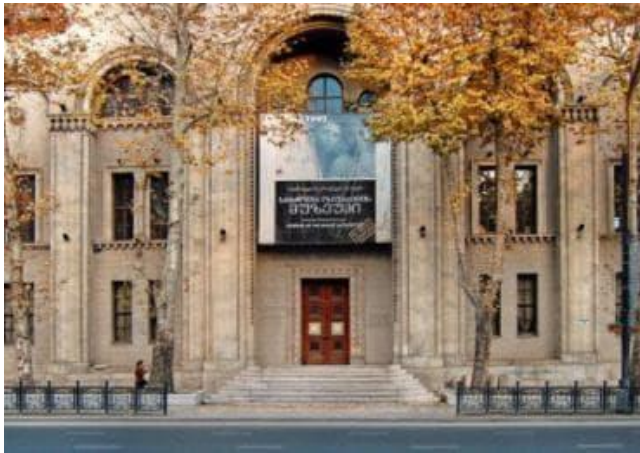
Georgian National Museum Address: 3/10 Shota Rustaveli st. Tbilisi.