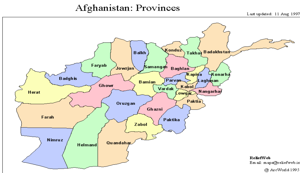
Figure 1: political division map of Afghanistan (15)

Afghanistan is divided in to 34 provinces. In some of the provinces living conditions, social welfare, security and service delivery are deferent, as a result of a lack of properly management. In some parts of Afghanistan (southern provinces) local government delivers no good services, but some provinces (Northern provinces) perform better.